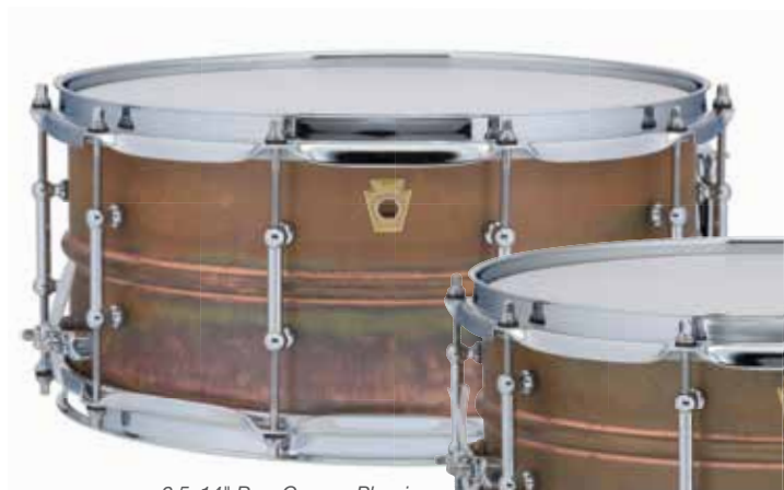
6.5x14" Raw Copper Phonic w/Tube Lugs (LC663T)

6.5x14" Hammered Acrolite w/Bowtie Lugs (LM405K)