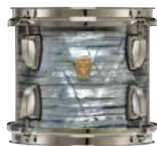
Sky Blue Pearl - 52