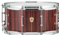
Red - LC