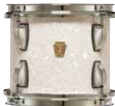
White Marine Pearl - OP