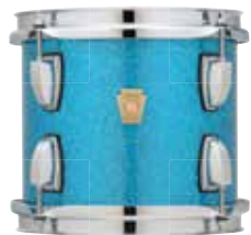
Teal Sparkle - 37