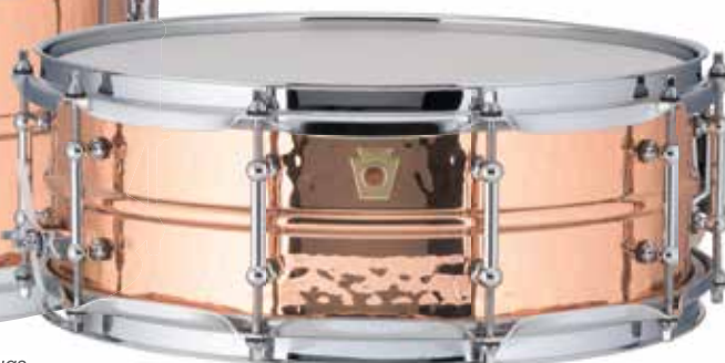
5x14" Hammered Copper Phonic w/Tube Lugs (LC660KT)