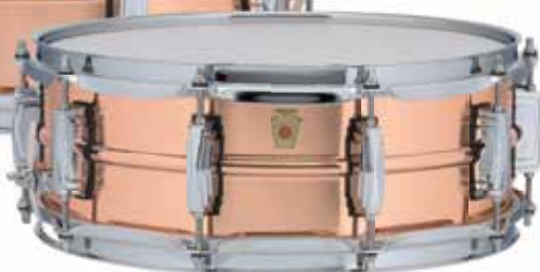
5x14" Copper Phonic w/ Imperial Lugs (LC660)

(Also available in 5x14" w/ Tube Lugs - LC660T)