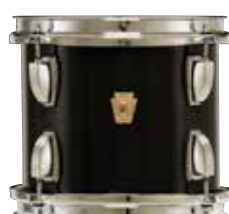
Black Cortex - OG