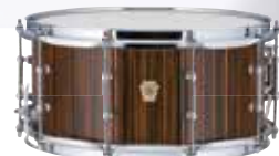
Orange - LO