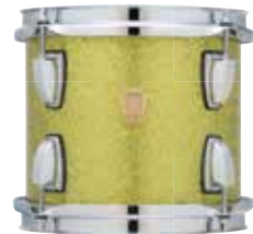
Olive Sparkle - 36