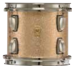
Champagne - SP