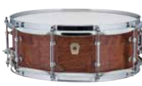
Bubinga Gloss - Z4