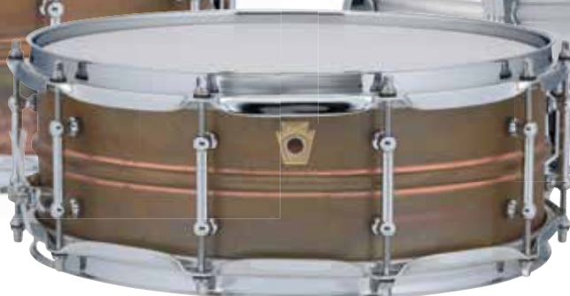
5x14" Raw Copper Phonic w/Tube Lugs (LC661T)