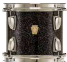
Black Galaxy - BG