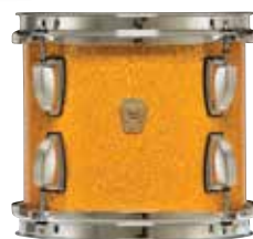
Gold Sparkle - 33