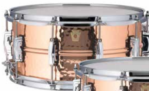
6.5x14" Hammered Copper Phonic w/Imperial Lugs (LC662K)