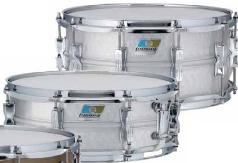
5x14" Hammered Acrolite w/Bowtie Lugs (LM404K)