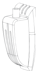
Large Classic Lug