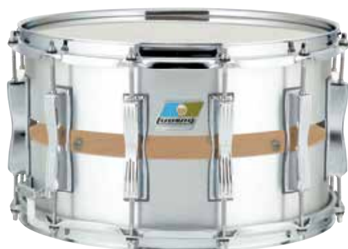
8x14" Slotted Coliseum, Brushed Silver (LS1284XX45)