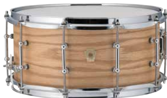
6.5x14" Classic Maple, Natural Oak finish (LS403TXBO)

Another new addition to the wood snare family is this new Classic Maple 6.5x14" snare with a beautiful Natural Oak exterior finish.