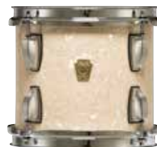
Vintage White Marine - NM