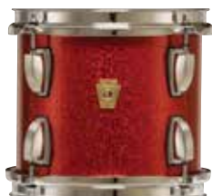
Red Sparkle - 27