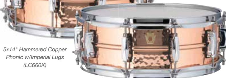
5x14" Hammered Copper Phonic w/Imperial Lugs (LC660K)

(Also available in 5x14" w/ Tube Lugs - LC660T)