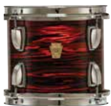
Red Oyster Pearl - RP