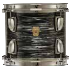
Vintage Black Oyster - 1Q