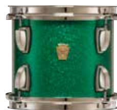
Green Sparkle - 54