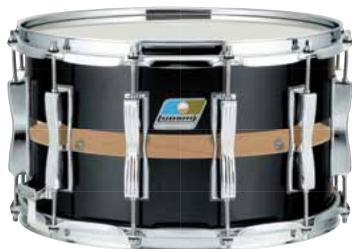
8x14" Slotted Coliseum, Black Cortex (LS1284XX4G)