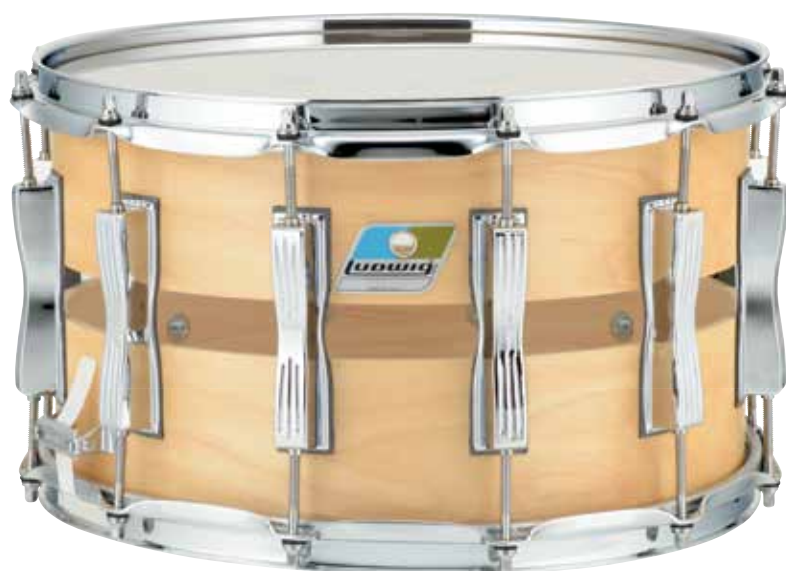
8x14" Slotted Coliseum, Maple Satin (LS1284XXSN)

Another new addition to the wood snare family is this new Classic Maple 6.5x14" snare with a beautiful Natural Oak exterior finish.