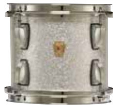
Silver Sparkle - OS