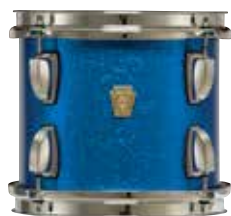
Blue Sparkle - 32