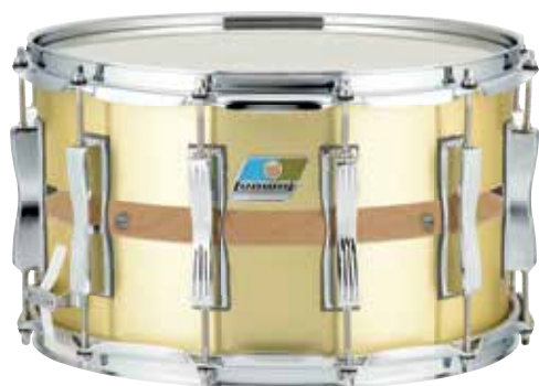
8x14" Slotted Coliseum, Brushed Gold (LS1284XX46)