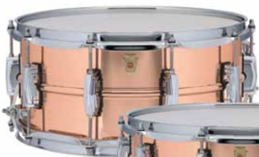
6.5x14" Copper Phonic w/Imperial Lugs (LC662) (Also available w/Tube Lugs - LC662T)