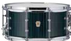
Green - LG