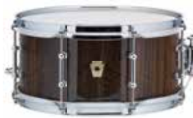
Fumed Eucalyptus - Z5