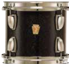
Black Sparkle - OR