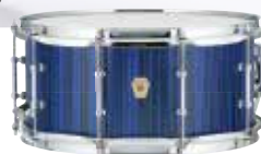
Blue - LB

Blue (LB), Red (LC), Green (LG), Black (LK), Orange (LO), Yellow (LY)