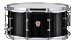
Black - LK