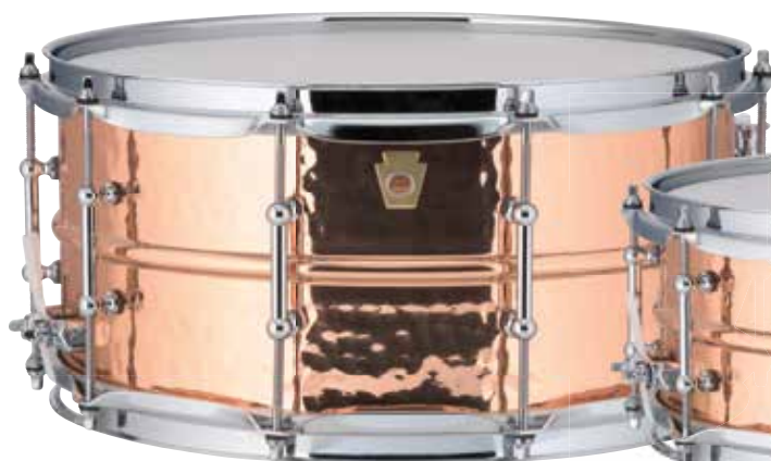
6.5x14" Hammered Copper Phonic w/Tube Lugs (LC662KT)