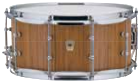
Teak Gloss - Z3