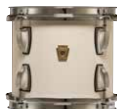
White Cortex - OF