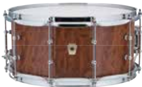
Makore Gloss - Z2