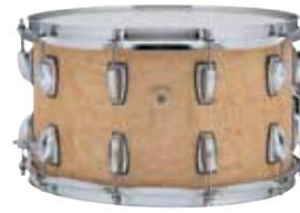
Birdseye Maple - Z6

Classic Maple Exotic series features a bold new look for 2016. We've taken our best selling Classic Maple shell and given it a serious facelift both inside and out! Now you can have your choice of six beautiful exotic wood finishes. Shell interiors are finished satin style, while the exteriors are finished in high gloss.